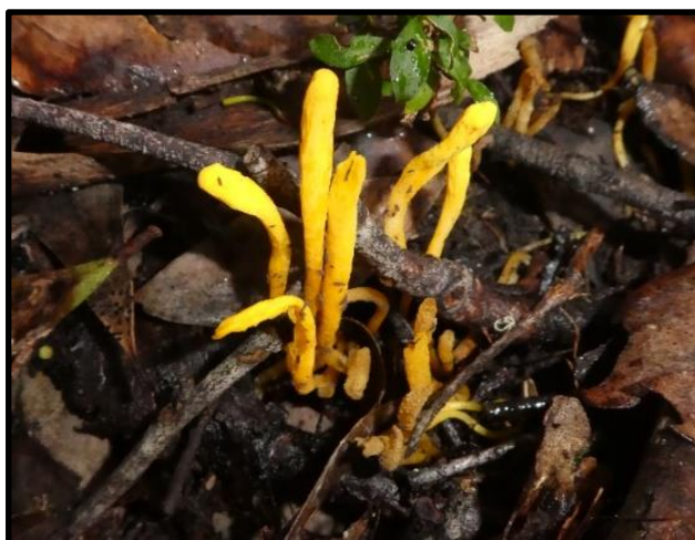
Clavaria amoena

It was a very pleasant day and so nice to be back with fellow members.