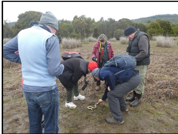
Looking at why the snake is dead