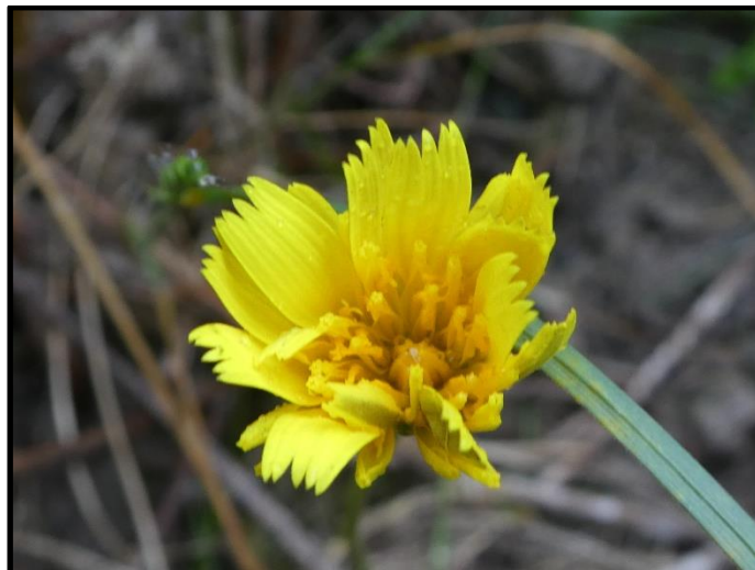
Leontodon saxatilis

Also noted Wombat, Pademelon and Bennett's wallaby scats, Echidna diggings, Engaeus mounds and a recently deceased copperhead snake on the dam shoreline.