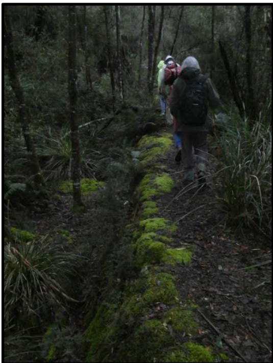
Creek above the Bridge

Most fared OK being suitably attired but some ended up a bit damp. The track itself goes along the spoil from the race construction and is easy going, just a very gentle rise following the contour. The area is very interesting and would be well worth a visit later. Jeff Campbell